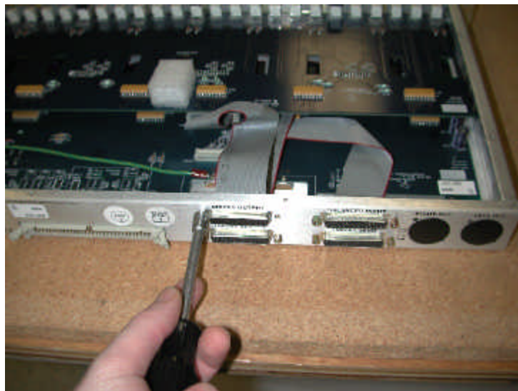
Remove blanking plate and thread standoffs through chassis into ribbon.