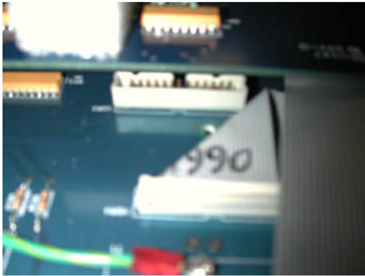
Locate HDR3 Direct Output Connector