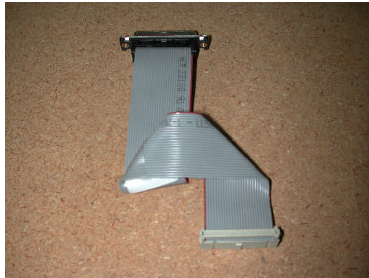
Fold ribbon as shown