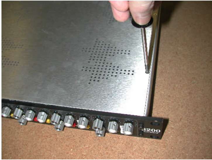
Remove (6) #4-40 lid screws.